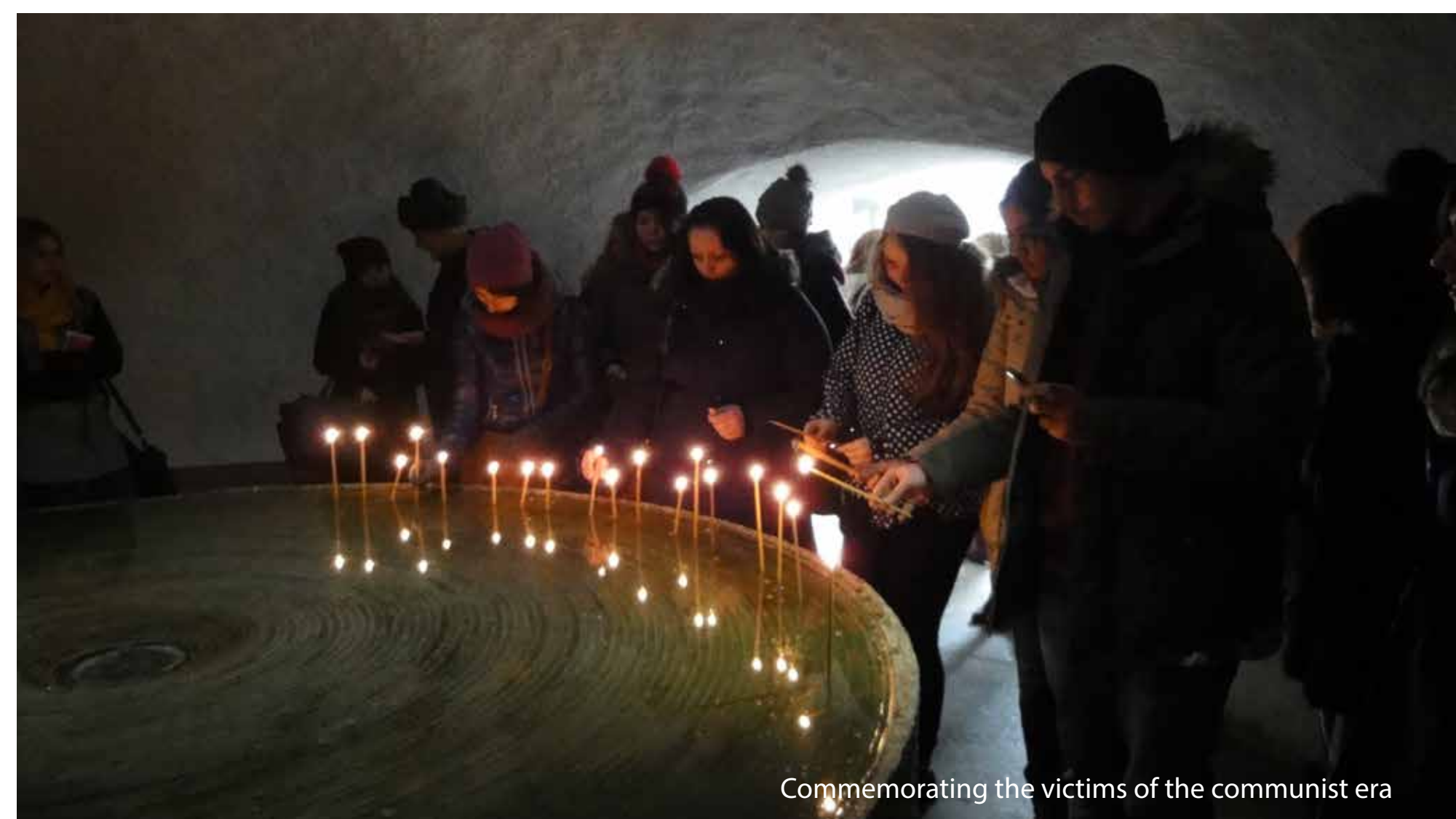
Commemorating the victims of the communist era

Later the team made a trip to Bârsana and visited Bârsana Monastery, one of the most famous tourist attraction of the county, where they saw the traditional wooden buildings typical for Maramureş architecture. Afterwards they met a woodcarver who explained to them some of the symbols of the wooden gates and they could admire some of his work shown there.