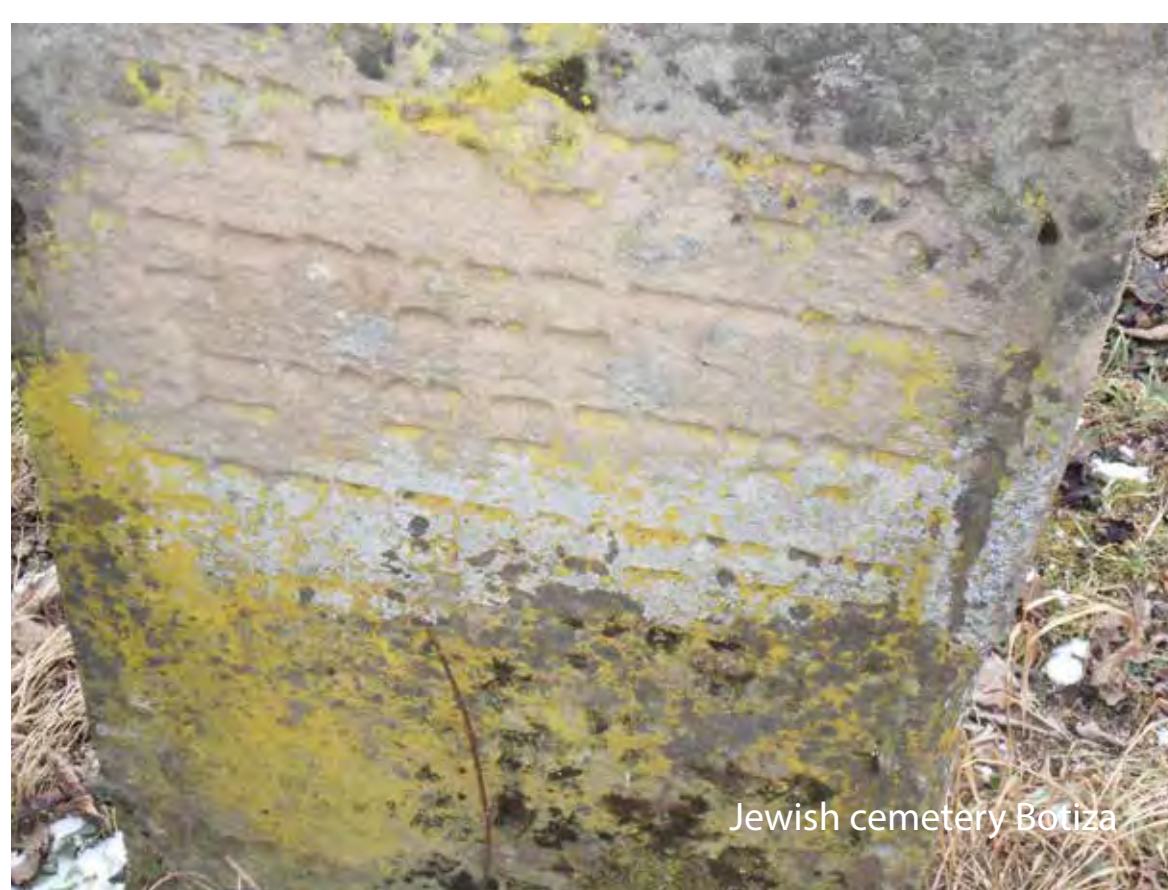
Jewish cemetery Botiza