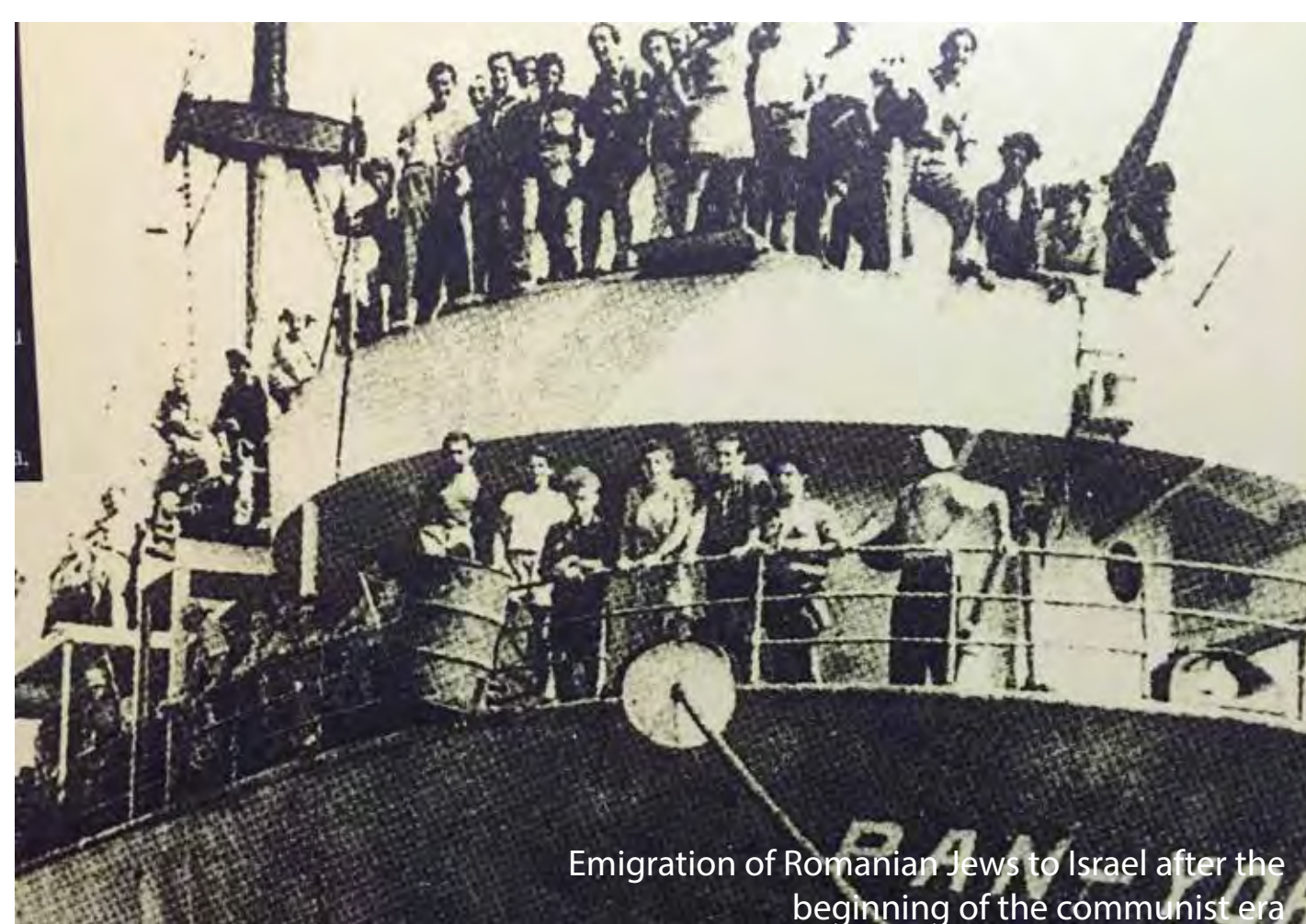
Emigration of Romanian Jews to Israel after the beginning of the communist era