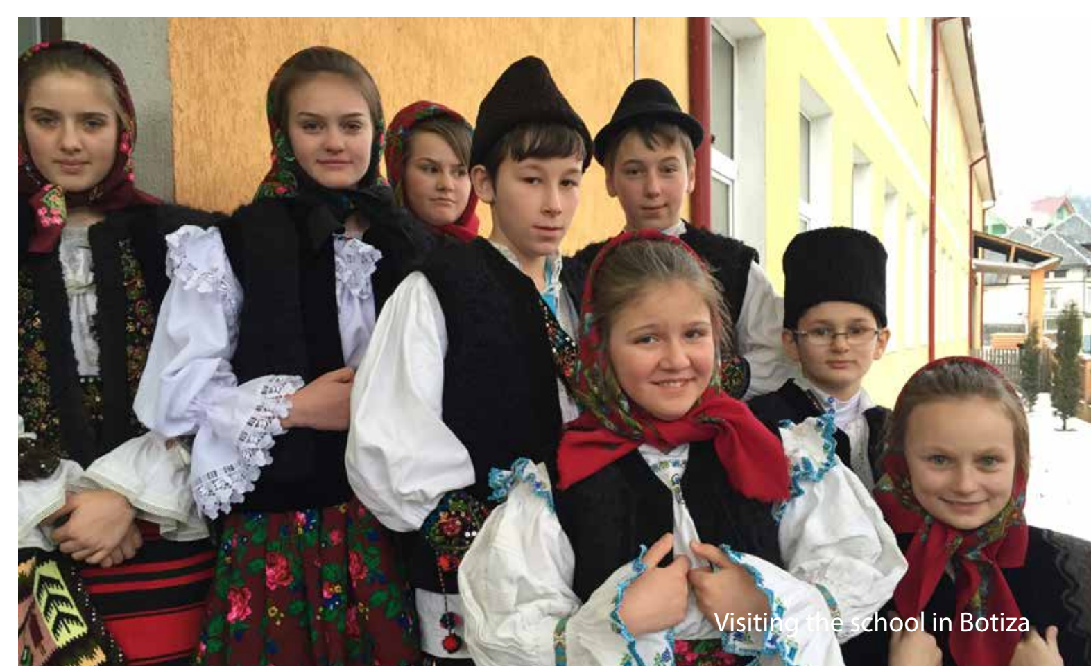
Visiting the school in Botiza