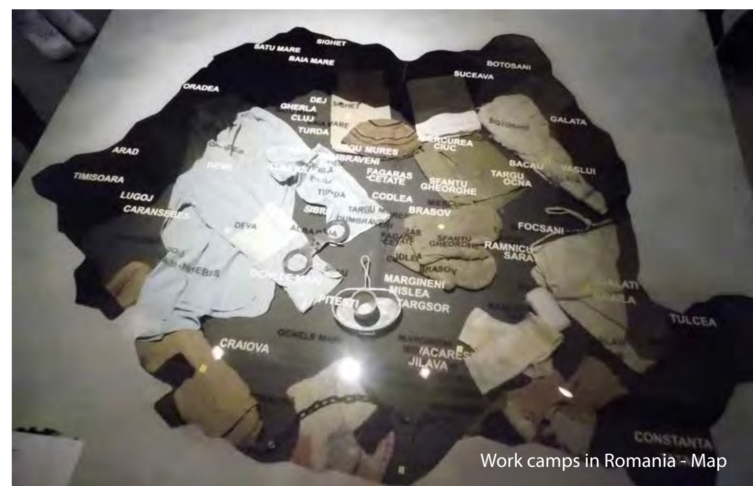
Work camps in Romania - Map